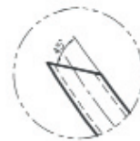
BI 129/T Special model Irrigation Handpiece, polished tip, open end Tip 45°