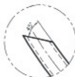
BI 124/T Irrigation Handpiece, polished tip open end Tip 45° (0.65mm)

The expected lifetime of our reusable medical devices is validated by a defined number of processing cycles. Please refer to the information provided in the instructions for use.