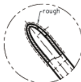
BA 119/T Special model Aspiration Handpiece, smooth abrasive (rough) tip, (0.70mm) Asp. port 0.35 mm