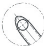
BI 123/T Irrigation Handpiece, round cannula, polished tip, dual 0.35 mm side ports