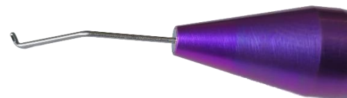
Angled Aspiration Handpiece right (R)

Please note: The expected lifetime of our reusable medical devices is validated by a defined number of processing cycles. Please refer to the information provided in the instructions for use.