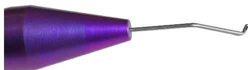
Angled Aspiration Handpiece left (L)